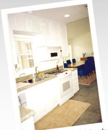
Ceiling Height Cabinets

There are many reasons to remodel your kitchen including: