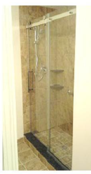
Custom Glass Doors