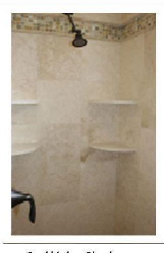
Built in Shelves