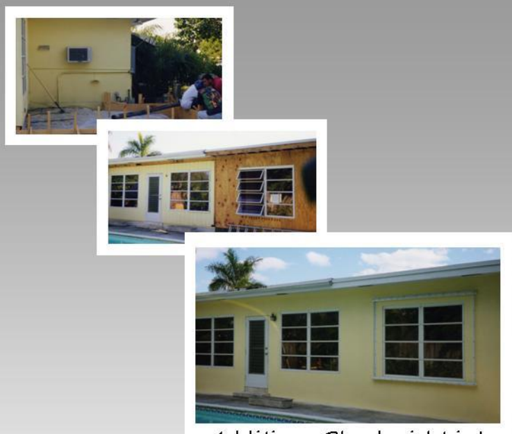
Addition-Blends right in!

Leading Edge Homes designs custom room additions including bedrooms, bathrooms, in-law suites, theaters, family rooms, and more! As a design-build company, Leading Edge Homes ensures that your addition will look like it has always been part of your home, without you needing to hire an architect. See what your addition will look like in 3-D and "walk through" the rooms before we even break ground. Contact us to see how we can help you add a bedroom, bathroom, in-law's suite, or room for any purpose you want.