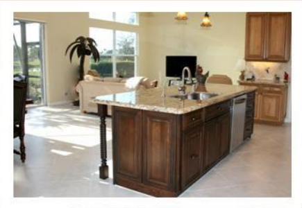
A Peek Inside